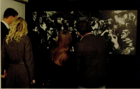
WORKS: In his unique hybrid works, born through the interaction of sculpture, photography and painting, Ansen transforms mundane daily objects that might otherwise escape attention.