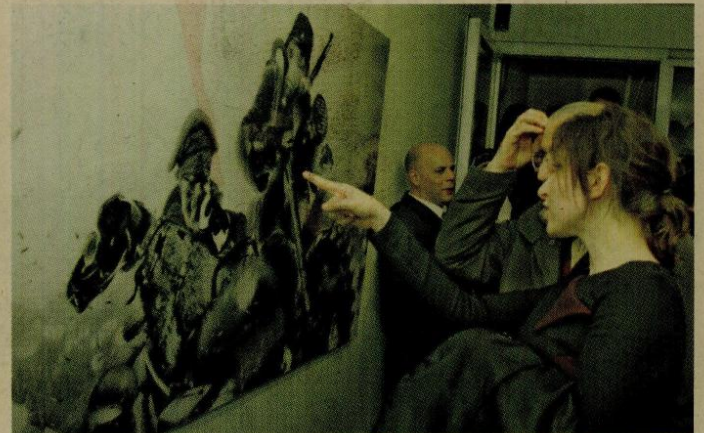
EXHIBITION: Visual uniqueness alone doesn't form the core of Ansen's works. It is a path which aims to carry the audience into a deeper inner connection.